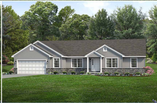
Family II Exterior