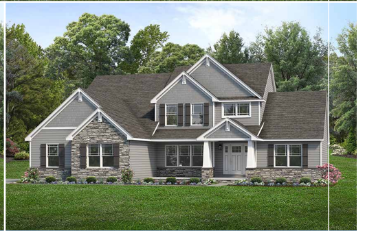
Craftsman II Exterior

More exteriors and details at WayneHomes.com