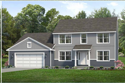
NEW! Smart Style Elevation