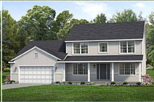
Tradition II Exterior