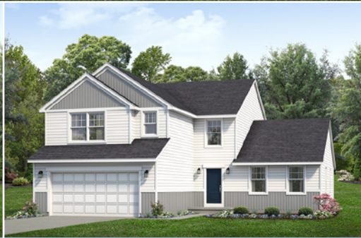
Smart Style Exterior