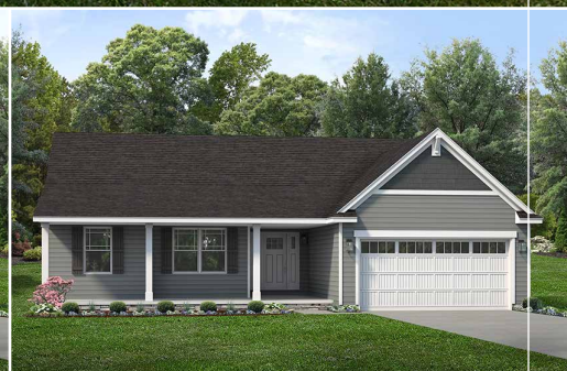
NEW! Craftsman II Exterior