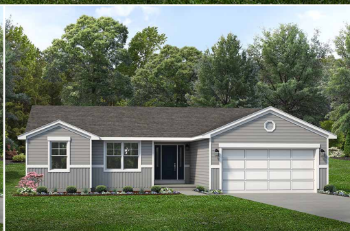
NEW! Smart Style Exterior