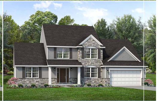
Legacy II Exterior

More exteriors and details at WayneHomes.com