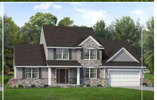
Legacy II Exterior