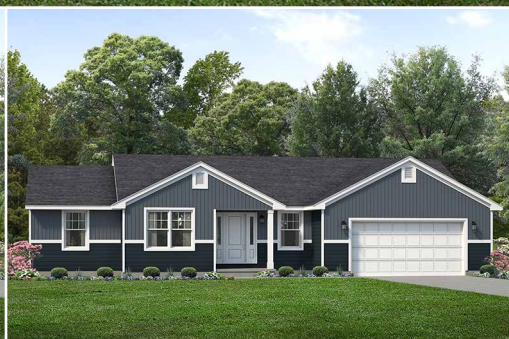
NEW! Smart Style Exterior