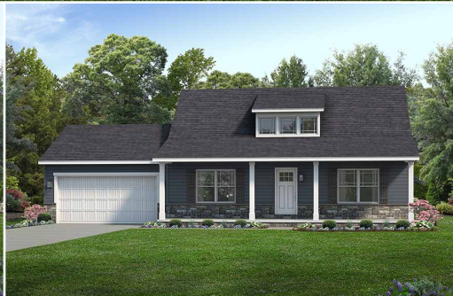
NEW! Craftsman II Exterior