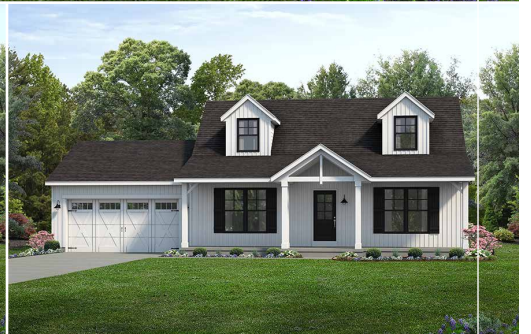
NEW! Farmhouse II Exterior

More exteriors and details at WayneHomes.com