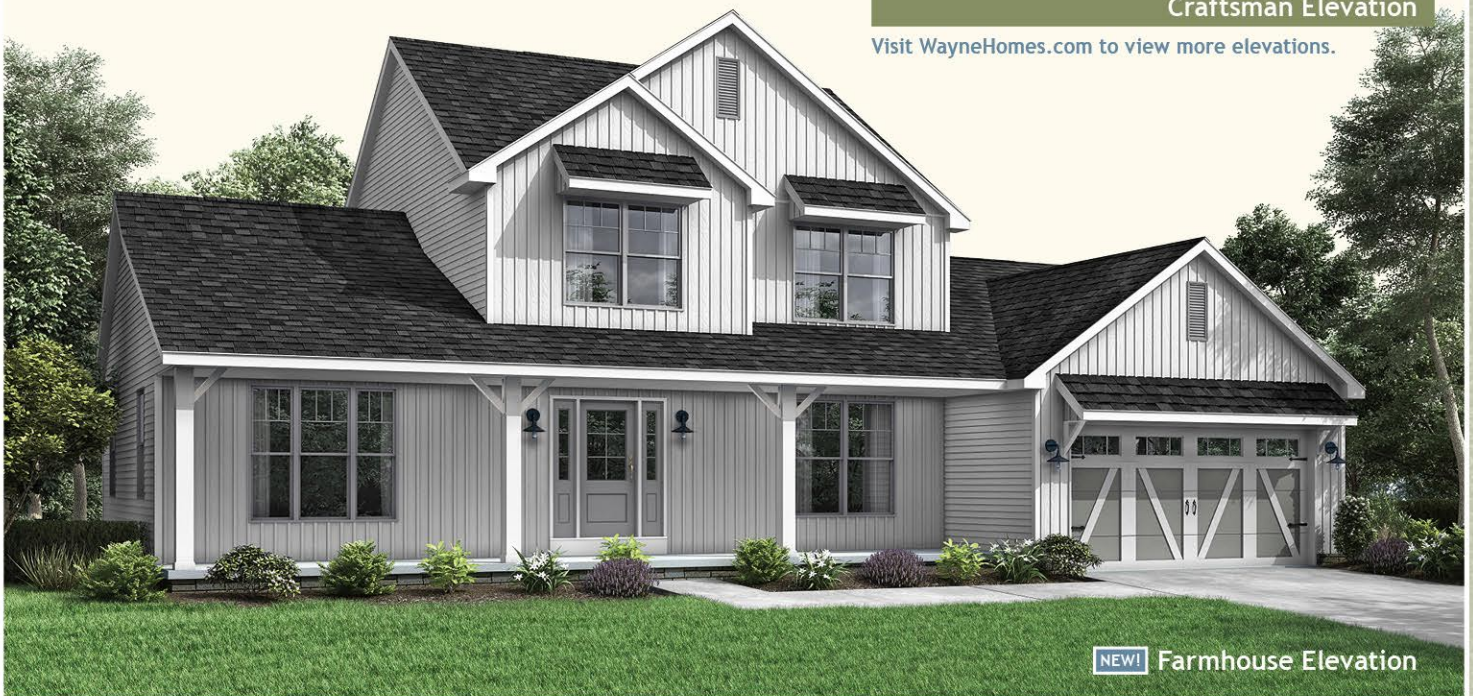
NEW! Farmhouse Elevation

Visit WayneHomes.com to view more elevations.