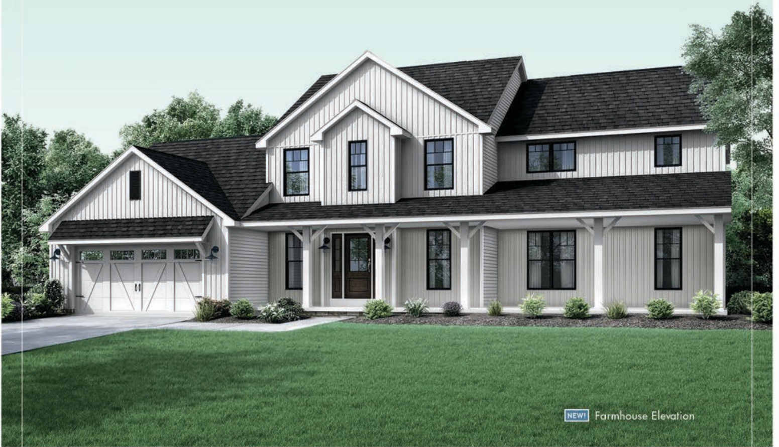
NEW! Farmhouse Elevation