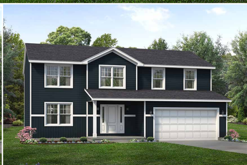
NEW! Smart Style Exterior