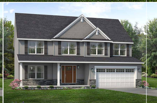
NEW! Craftsman II Exterior

More exteriors and details at WayneHomes.com