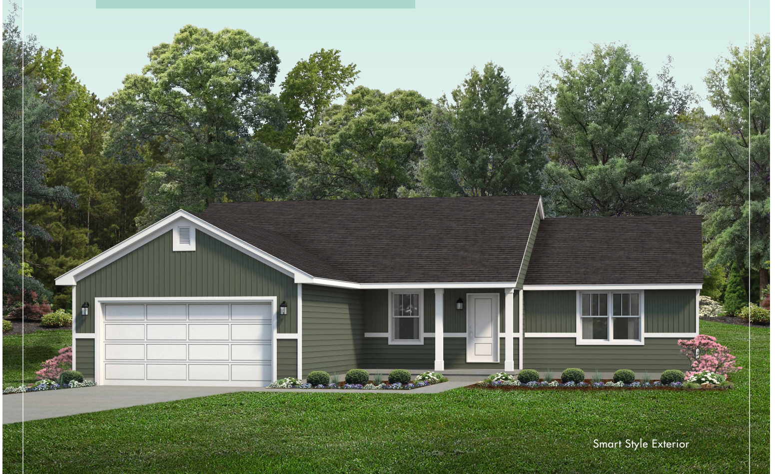
Smart Style Exterior