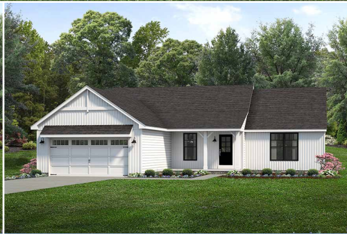
Farmhouse II Exterior