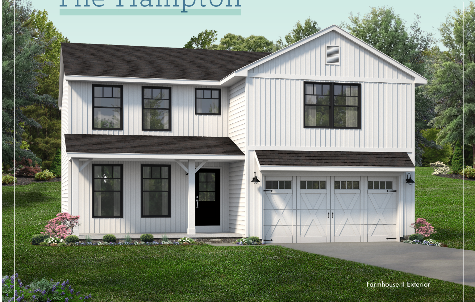
Farmhouse II Exterior