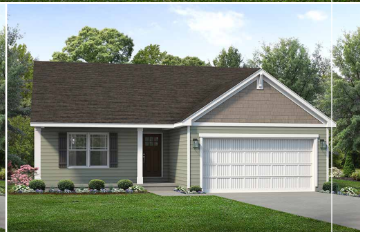
Craftsman II Exterior