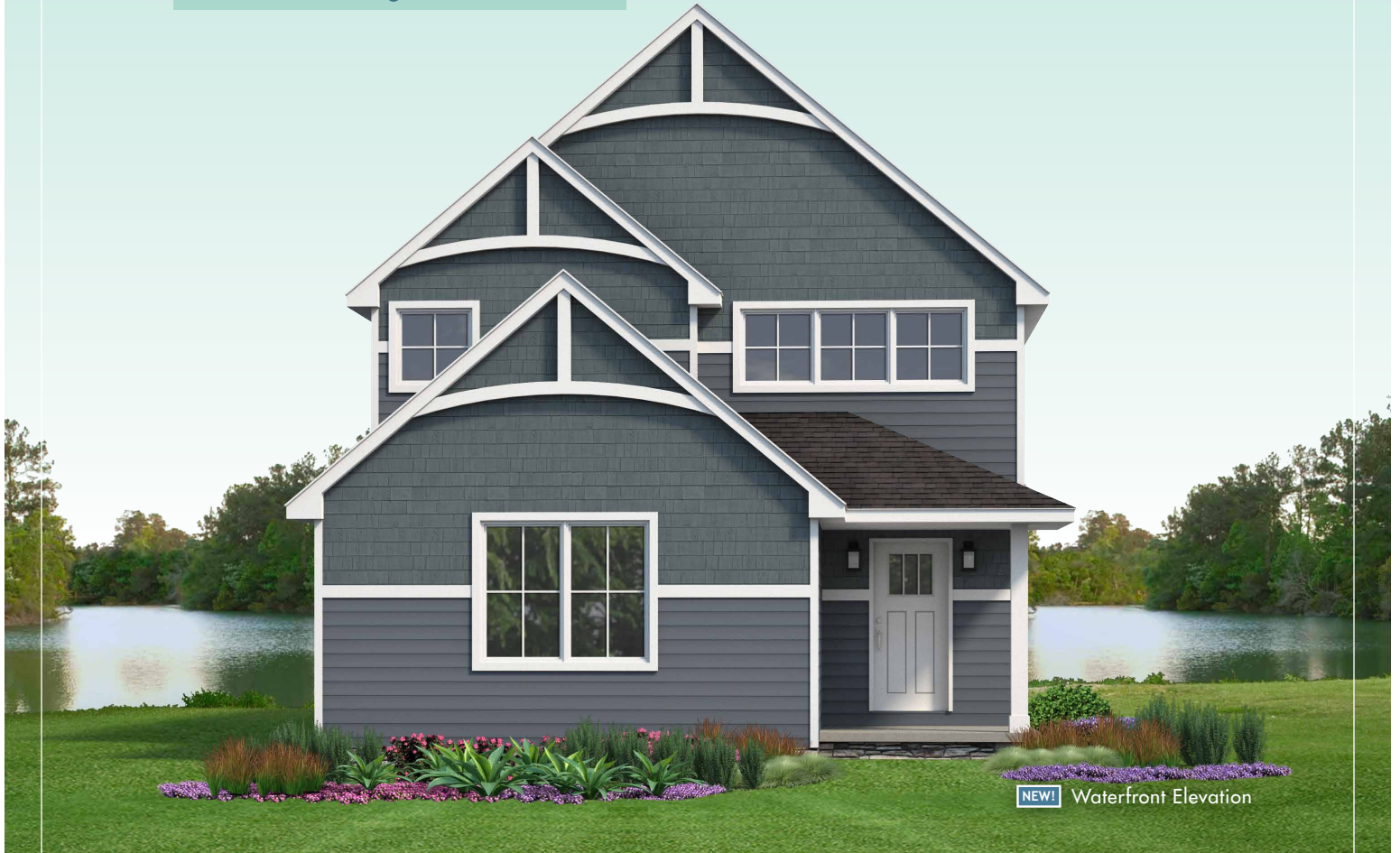
NEW! Waterfront Elevation