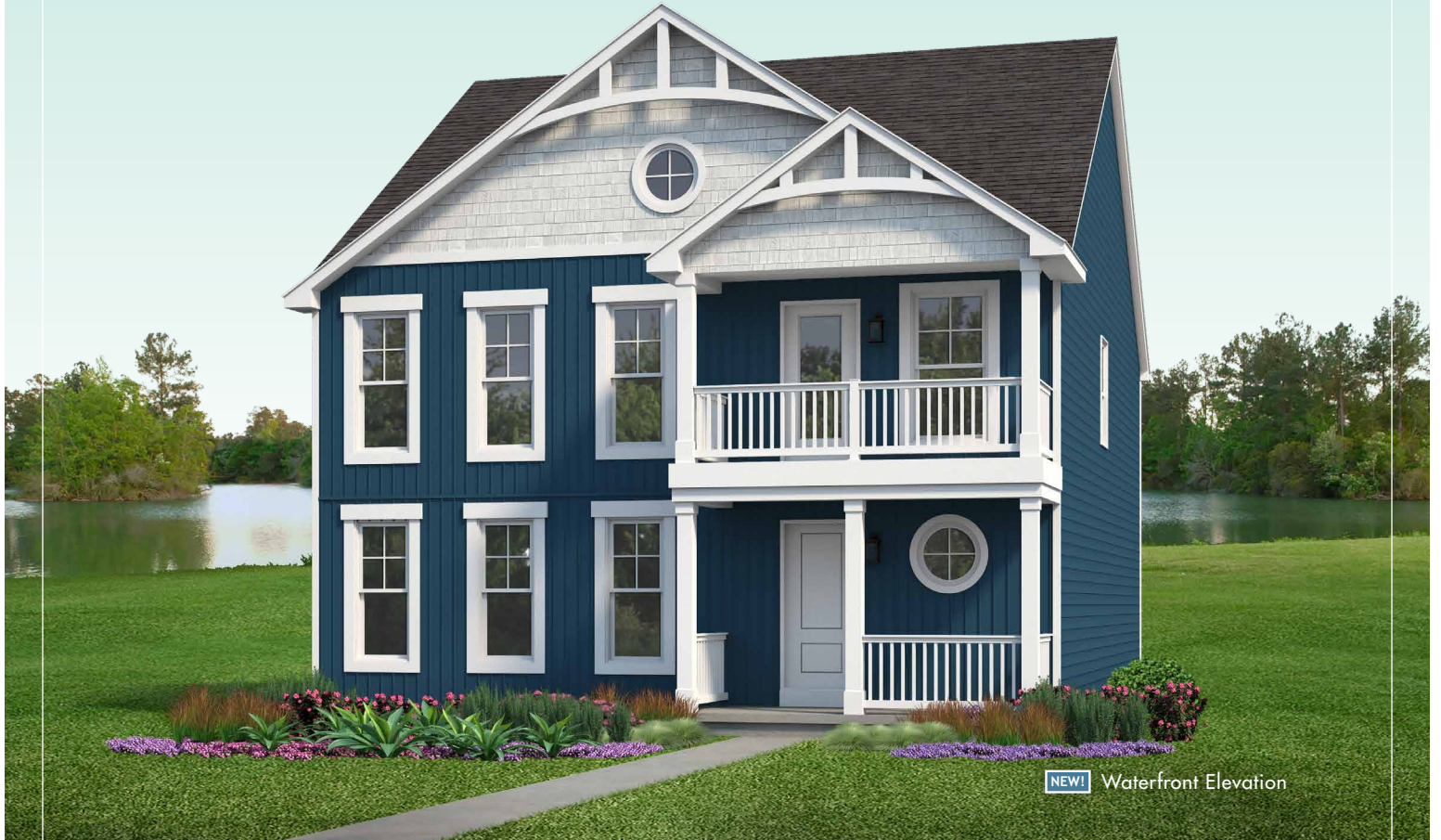
NEW! Waterfront Elevation