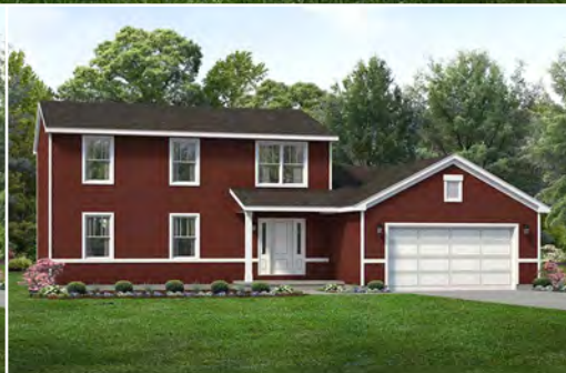
NEW! Smart Style Exterior