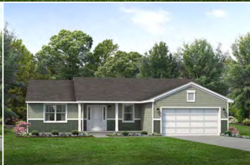
NEW! Smart Style Exterior