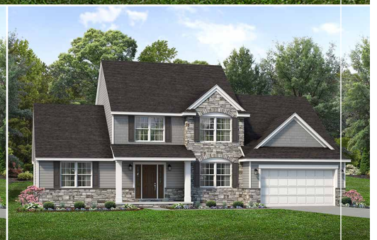
NEW! Legacy II Exterior

More exteriors and details at WayneHomes.com