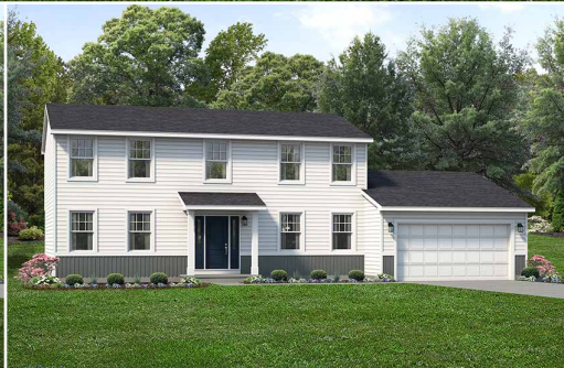
NEW! Smart Style Exterior