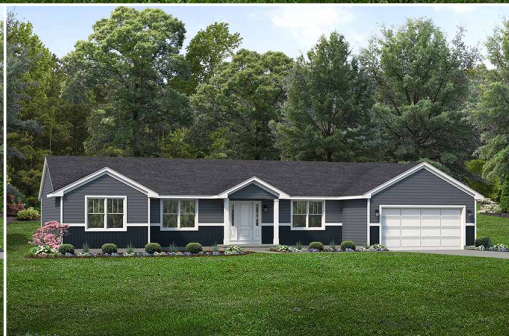
NEW! Smart Style Exterior