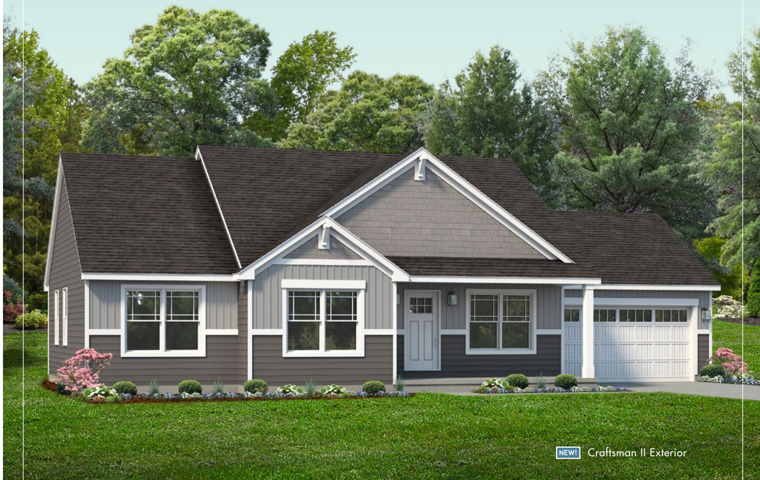
NEW! Craftsman II Exterior