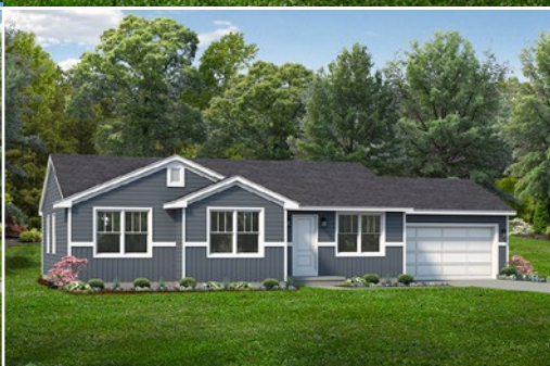
NEW! Smart Style Exterior