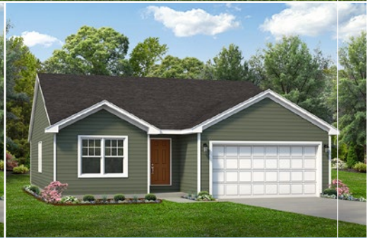
NEW! Family II Exterior

More exteriors and details at WayneHomes.com