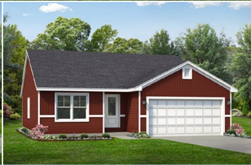
NEW! Smart Style Exterior