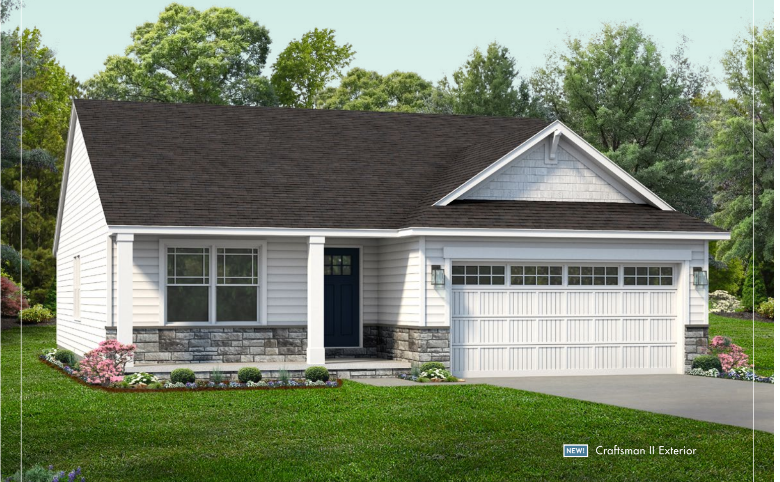
NEW! Craftsman II Exterior