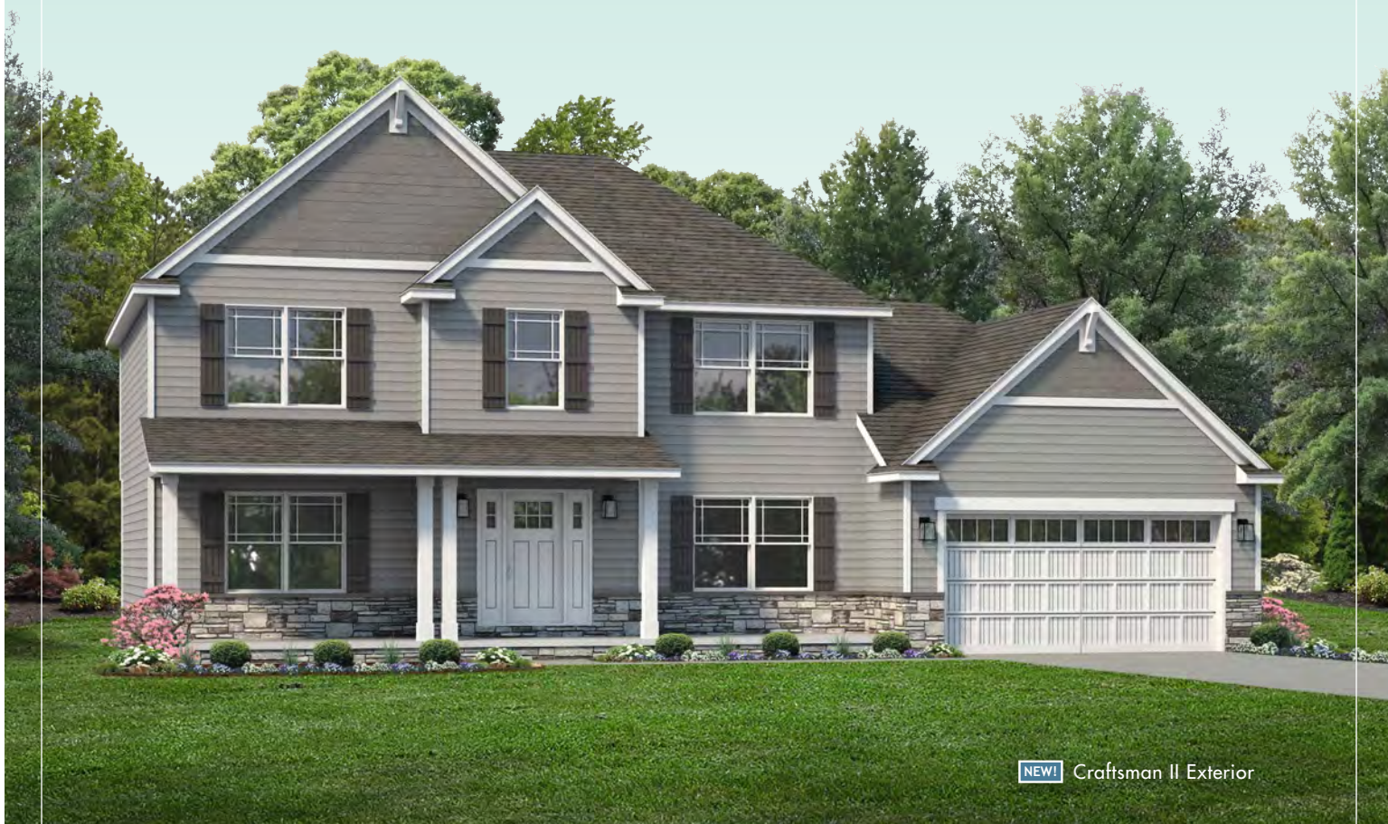
NEW! Craftsman II Exterior