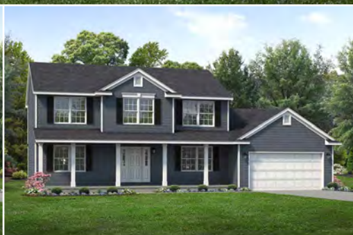
NEW! Tradition II Exterior