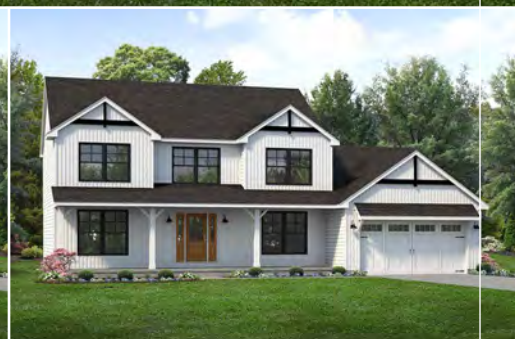
NEW! Farmhouse Exterior