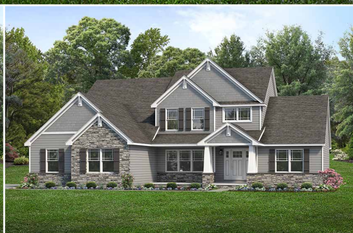
NEW! Craftsman II Exterior