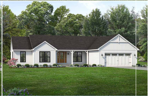
NEW! Farmhouse Exterior

More exteriors and details at WayneHomes.com