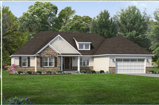
NEW! Craftsman II Exterior