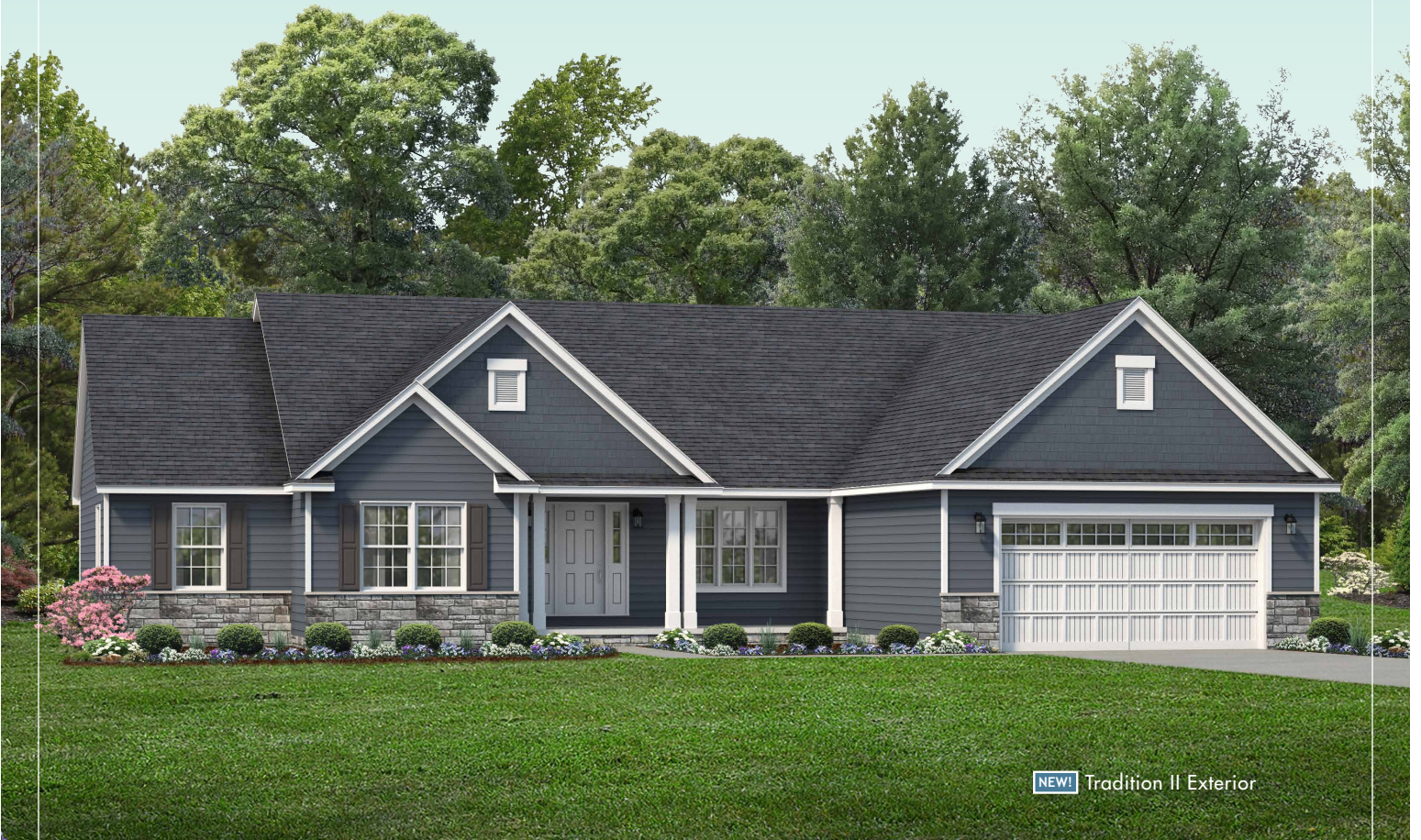
NEW! Tradition II Exterior