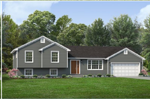
NEW! Tradition II Exterior