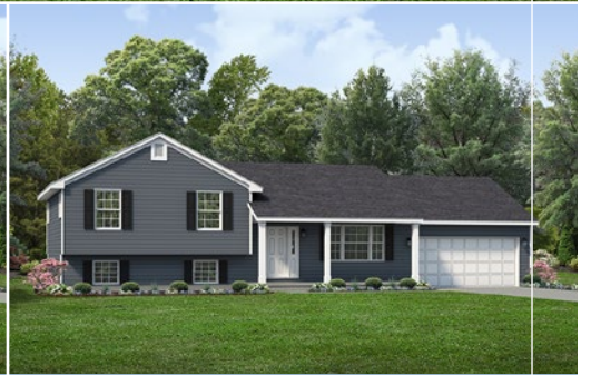
NEW! Family II Exterior