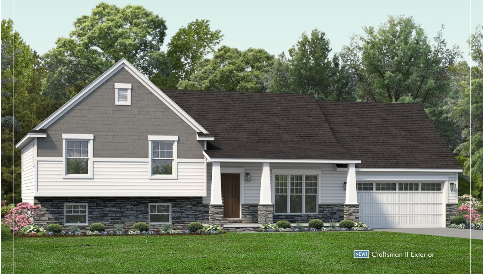
NEW! Craftsman II Exterior