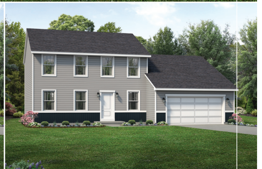
Smart Style Exterior