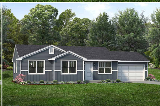
Smart Style Exterior