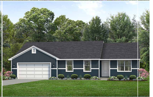
Smart Style Exterior