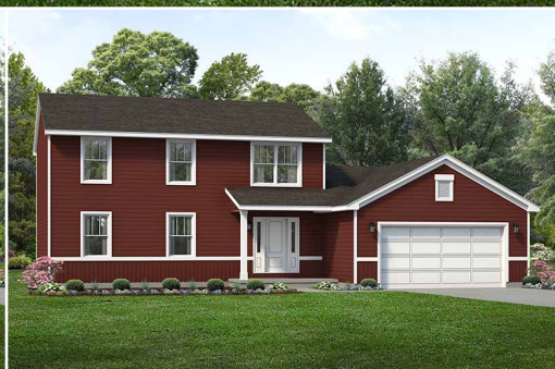
Smart Style Exterior