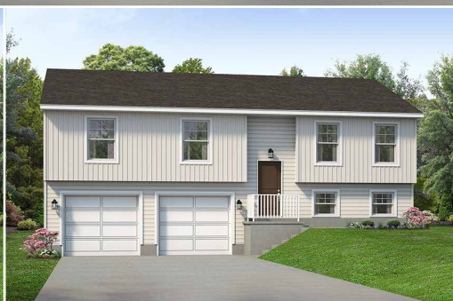
Smart Style Exterior