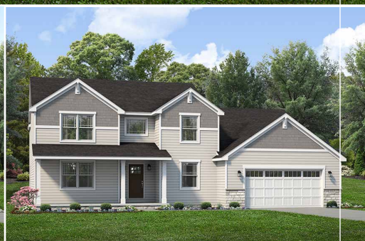
NEW! Craftsman II Exterior

More exteriors and details at WayneHomes.com