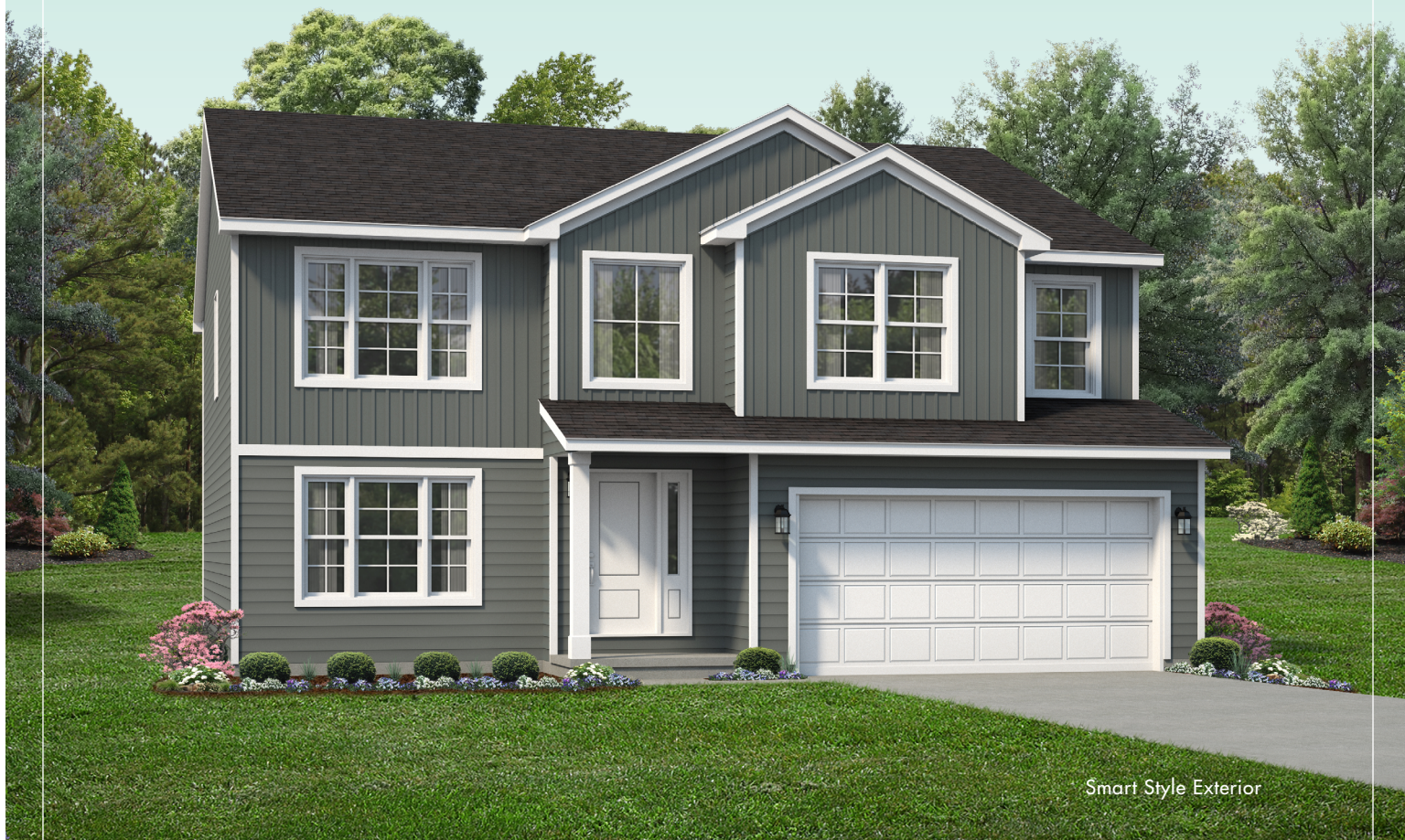
Smart Style Exterior