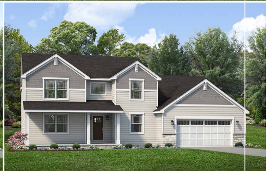
Craftsman II Exterior

More exteriors and details at WayneHomes.com