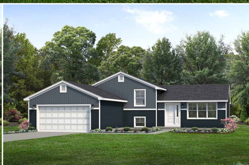
Smart Style Exterior