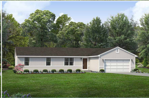
Smart Style Exterior