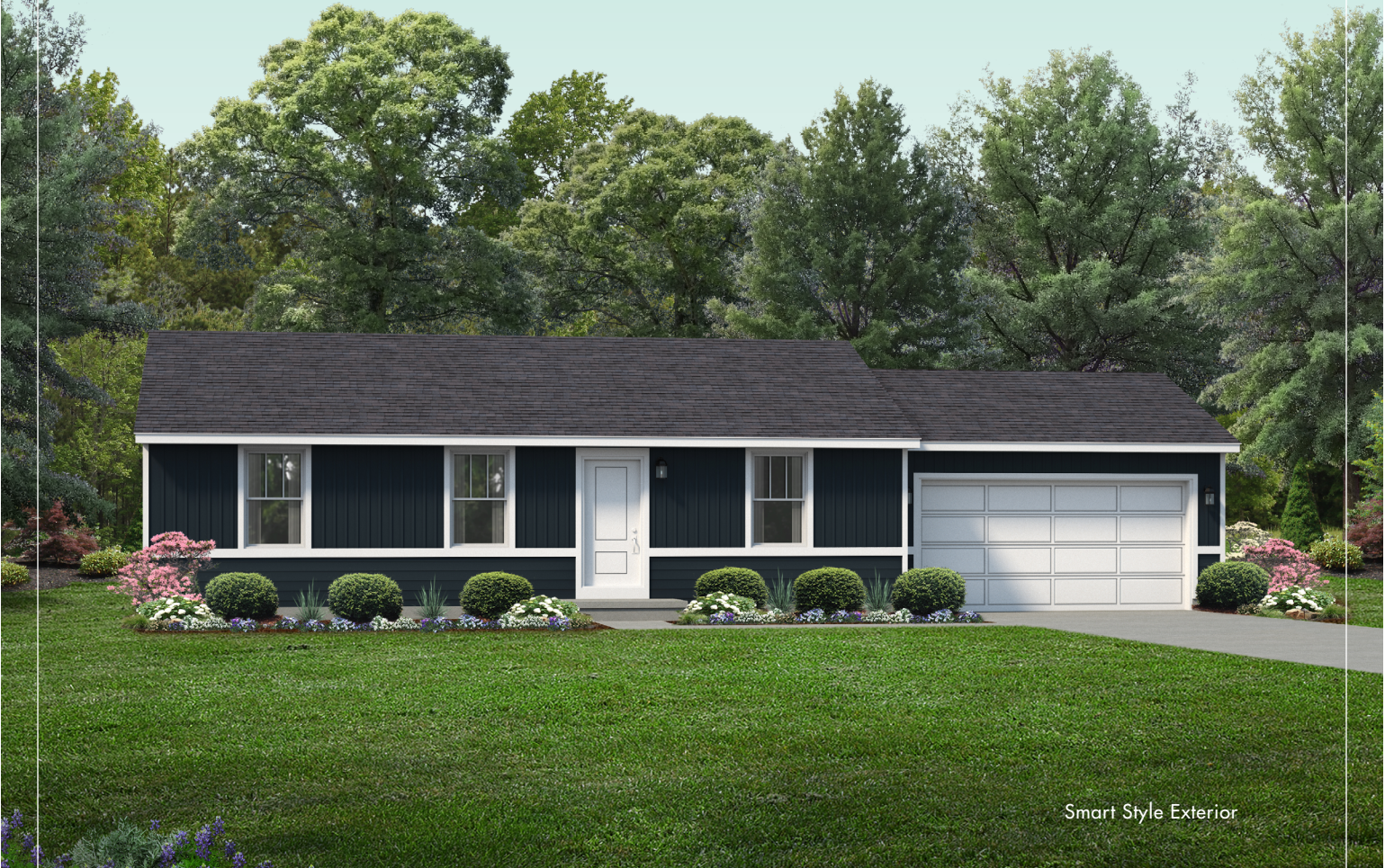
Smart Style Exterior