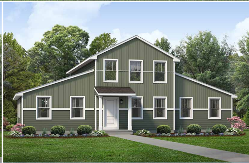
Smart Style Exterior