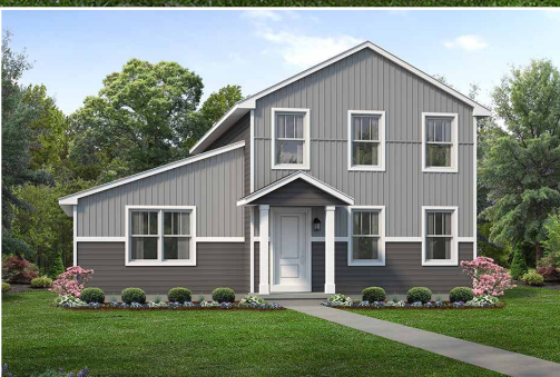
Smart Style Exterior