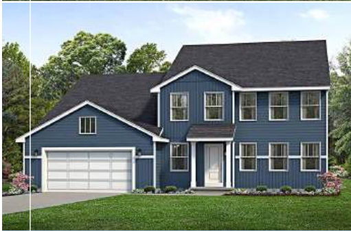
Smart Style Exterior