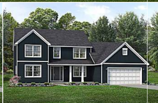
Smart Style Exterior