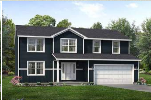
Smart Style Exterior