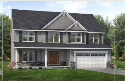
Craftsman II Exterior