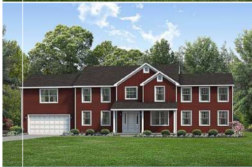
Smart Style Exterior